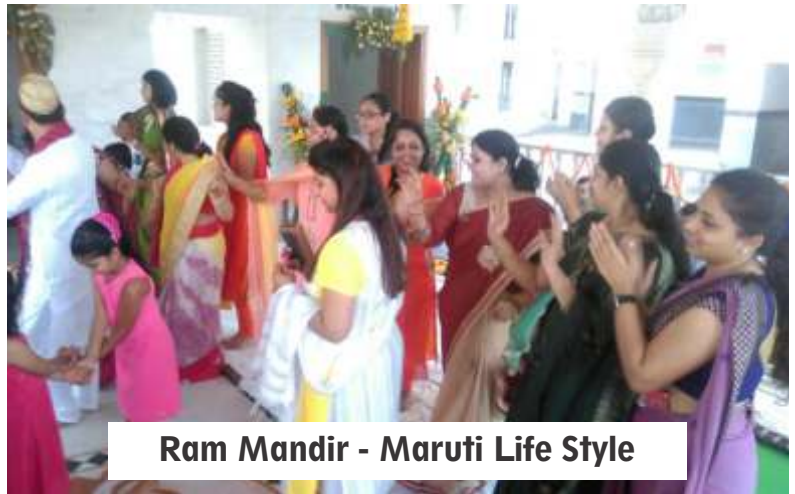
Ram Mandir - Maruti Life Style

Maruti Lifestyle, a spanish theme based residential project is the landmark project of Avinash Group, which caters to the premium class of the society. Ram Navmi is one of the most important festivals of hindu tradition which was celebrated at Shri Ram Mandir of Maruti Lifestyle. On this auspicious occasion families of entire society and management got together to celebrate the Ram Janmotsav with great enthusiasm. A grand procession took place after the pujan and bhog prasaadi was distributed. All the devotees appreciated and enjoyed the program.