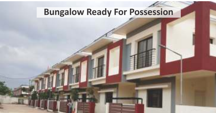
Bungalow Ready For Possession