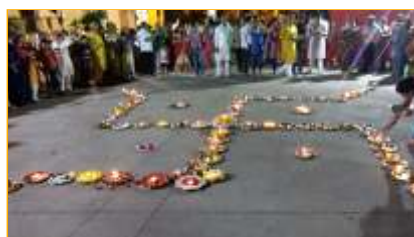
Maha Aarti (maruti Lifestyle)