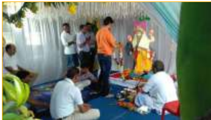
Vishkarma Pooja (Avinash New County)