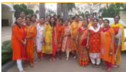
Sawan Celebration (Maruti Lifestyle)