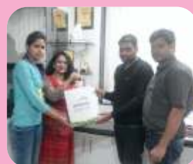
Khubchand Miree Avinash Capital Home 2