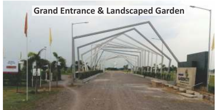
Grand Entrance & Landscaped Garden