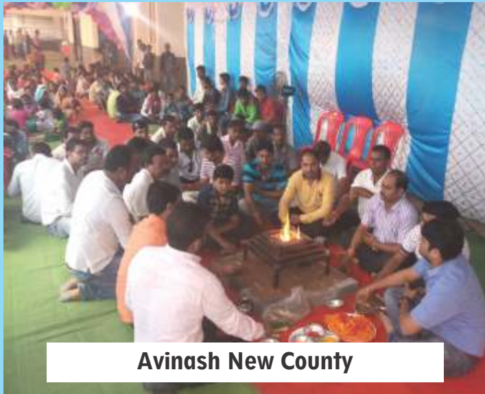
Avinash New County