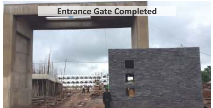
Entrance Gate Completed