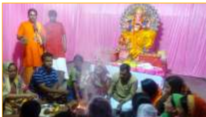
Ganesh Pooja (Avinash Pride)