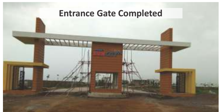
Entrance Gate Completed