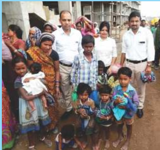
Magneto Signature Homes