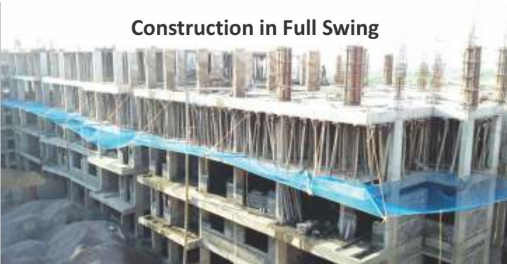
Construction in Full Swing