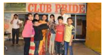
Children's Day (Avinash Pride)