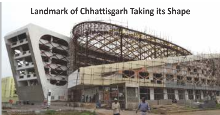
Landmark of Chhattisgarh Taking its Shape