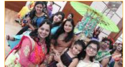
Lohri Celebration (Maruti Lifestyle)