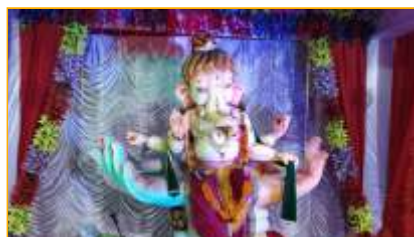
Ganpati Ji (Maruti Lifestyle)