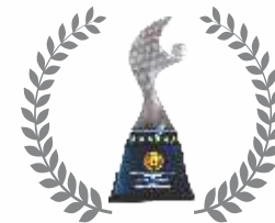
Maruti Lifestyle 6 Star Rated Project In Central India CRISIL 6 Star Rating