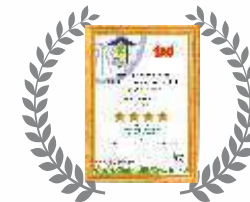
Maruti Solitaire Chhattisgarh's 1st Certified Green Building 4 Star GRIHA Certified Project (TERI)