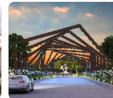
Avinash Garden City Near DPS, Semaria, Raipur