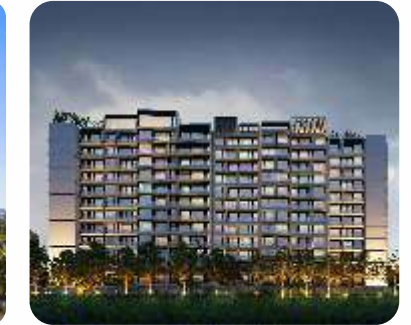
Lifestyle Towers Near maruti lifestyle, Kota, Raipur