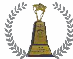
Avinash Group Best commercial Developer of Central India National Awards 2010