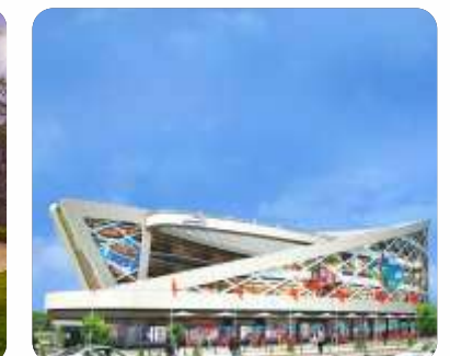
Avinash Times Square Sector 19, Naya Raipur