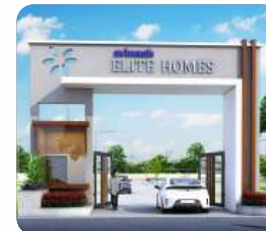
Avinash Elite Homes Behind AG Office, Vidhan Sabha Road, Raipur