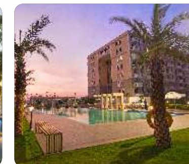
Maruti Lifestyle Kota Rd, Kota, Raipur