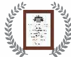
Avinash New Country ASIA's 100 Best Awarded Projects 2014-15