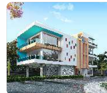
Avinash Sun City Daldal Seoni, Raipur