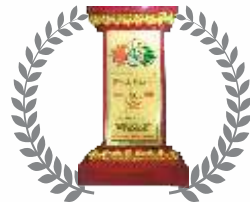
Avinash Group Women Empowerment & Gender Equity CSR Award 2017