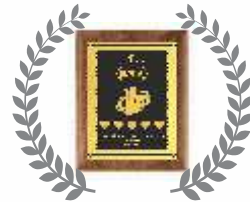
Time Square mall GEM certified sustainable Building, Dec 2020 Sustainable Time Square Mall, Naya Raipur