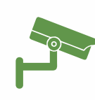
CCTV Camera at Entrance Gate