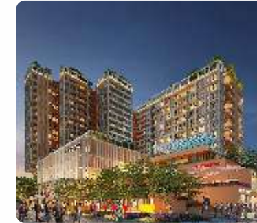
Avinash One Opp. magneto mall, Raipur