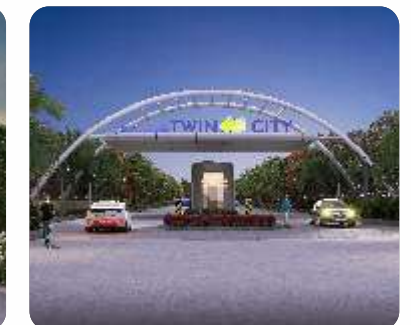
Avinash Twin City Kumhari Toll Plaza, Bhilai