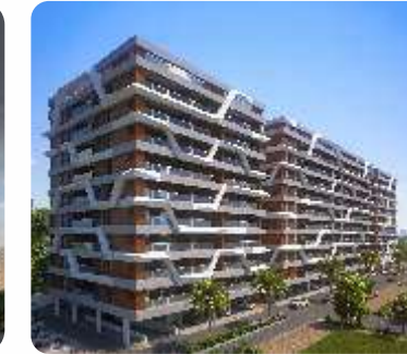
Magneto Signature Homes 2 Behind Magneto The Mall,raipur