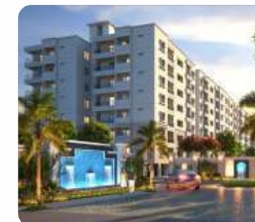
Avinash Metropolis Kohka-Junwani Road, Bhilai