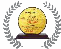
Avinash Group Conservation & Plantation - CSR Award 2019