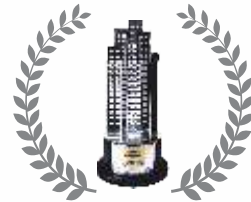
Avinash Pride Best Project in LIG Category PMAY Empowering India Awards 2019