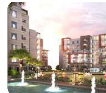
Avinash Capital Homes 2 Behind Ambuja Mall, Saddu, Raipur,