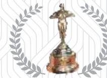
Club Paraiso The Best Club House Real Estate Achievers Award 2015