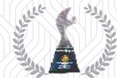
Maruti Lifestyle 6 Star Rated Project in Central India CRISIL 6 STAR RATING