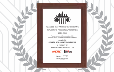
Avinash New County ASIA's 100 Best Awarded Projects 2014-15