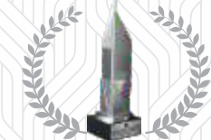
Magneto The Mall Best Commercial Property in Eastern Region CNBC Awaaz-CREDAI Real Estate Awards 2010