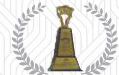
Avinash Group Best Commercial Developer of Central India National Awards 2010