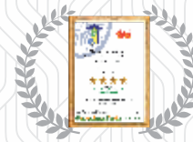
Maruti Solitaire Chhattisgarh's 1st Certified Green Building 4 Star GRIHA Certified Project (TERI)