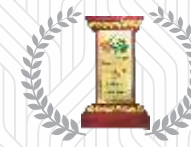
Avinash Group Woman Empowerment & Gender Equity CSR Award 2017