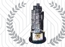
Avinash Pride Best Project in LIG Category PMAY Empowering India Awards 2019