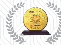
Avinash Group Conservation & Plantation-CSR Award 2019