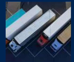
'Pay & Park' Parking Facility

Ensures every business operation takes place in a stable, risk-free environment.