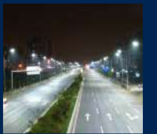
60 ft. Wide Bitumen Road with Divider and Street Lights

Ensures smooth business both at day and night.