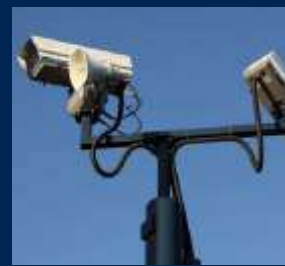
Secured Campus Ensures a businessfriendly zone.

Ensures the maintenance of a robust system both inside and outside the Park.