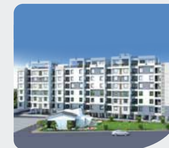
Avinash Atulya Geedam Road, Jagdalpur