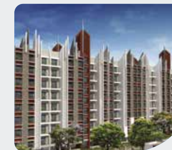
Avinash New County Sector 30, Naya Raipur