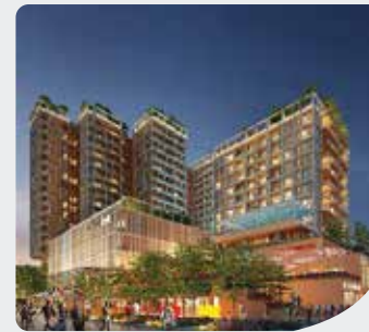
Avinash One Opp. Avinash Magneto the Mall, Raipur