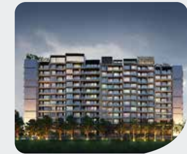
Lifestyle Towers Near maruti lifestyle, Kota, Raipur