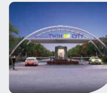
Avinash Twin City Kumhari Toll Plaza, Bhilai