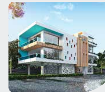
Avinash Sun City Daldal Seoni, Raipur