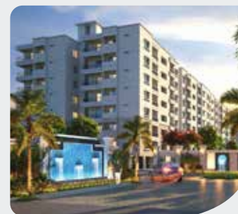
Avinash Metropolis Kohka-Junwani Road, Bhilai