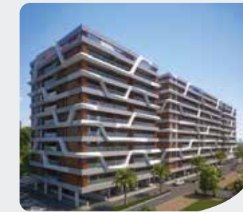
Magneto Signature Homes 2 Behind Magneto The Mall, Raipur