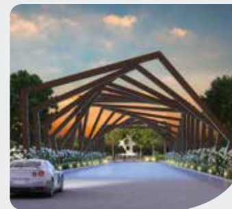
Avinash Garden City Near DPS, Semaria, Raipur