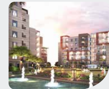
Avinash Capital Homes 2 Behind Ambuja Mall, Saddu, Raipur